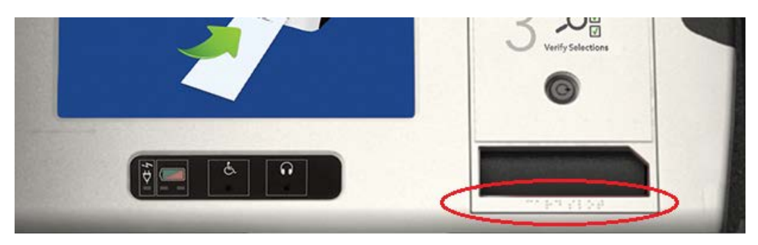
Braille on ExpressVote Face Instructs Voter

Each ExpressVote includes the following functionality: