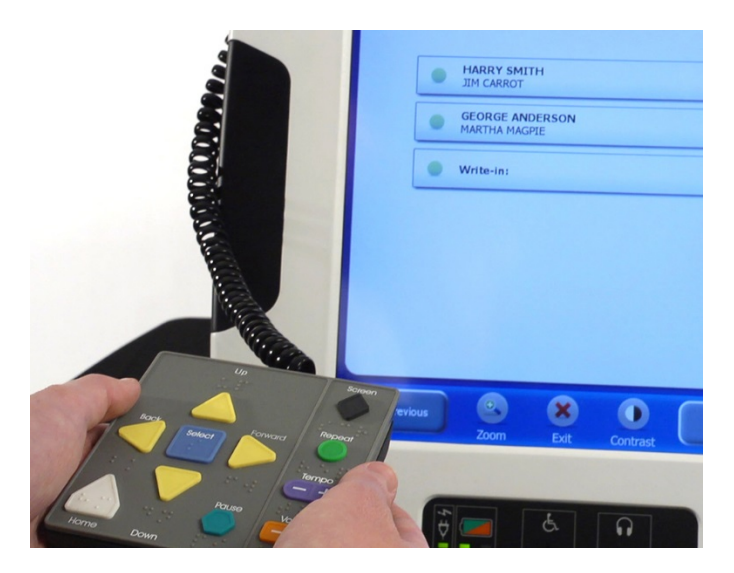
Keypad with Shaped Buttons and Braille

Audio voting session via text-to-speech or .wav files. Voters can privately listen to instructions and selections at a volume, tone, and speed that will meet their unique needs.